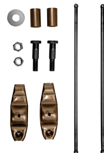
Rocker Arm Kit

FR/FS/FX 481V, 541V, 600V (603cc ENGINES)